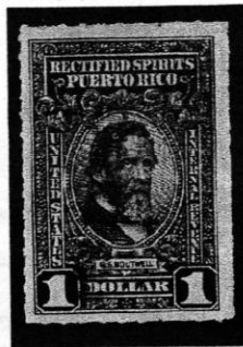
Puerto Rico RE51